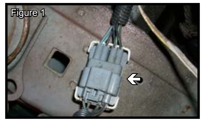
Note: Typical inline connector shown, your vehicle's connector may vary.