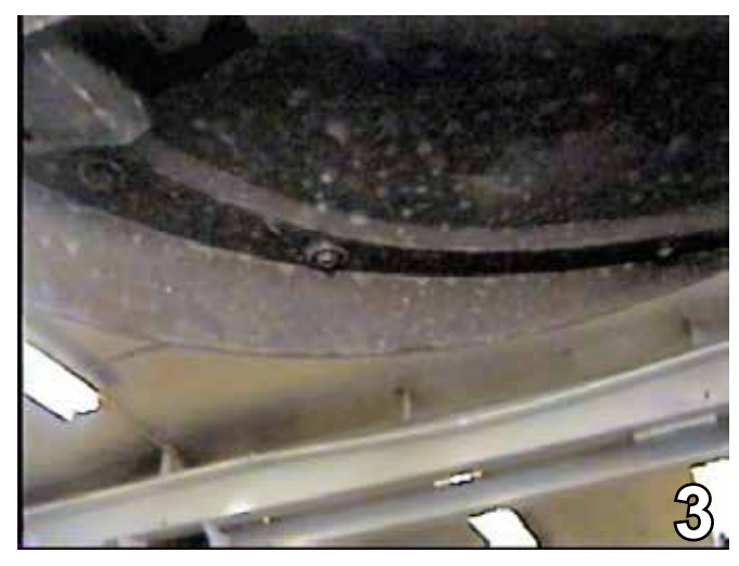
3. Using the 6MM socket, remove three metric bolts, just forward of the front tire. Set metric bolts aside to be reinstalled later. Do this to both sides of the vehicle.