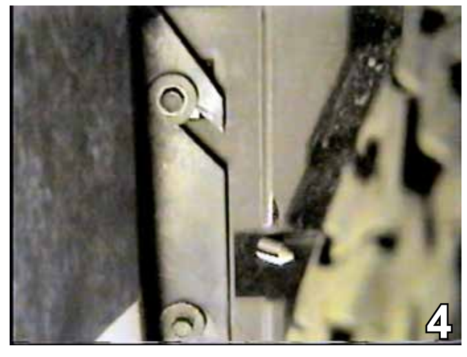
Using the 7MM socket, remove three metric bolts from inside the wheel well. Set the bolts aside to be reinstalled later. Do this to both sides of the vehicle.