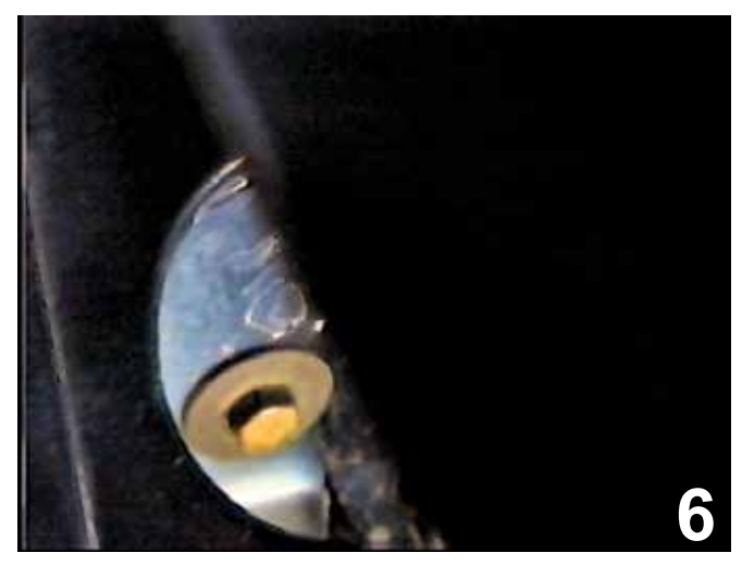
6. Using the 10MM socket, remove the back metric bolt from the corner of the fascia, inside the wheel well. Set the metric bolt aside to be reinstalled later. Do this to both sides of the vehicle. Pull the fascia forward and set it carefully aside to be reinstalled later.